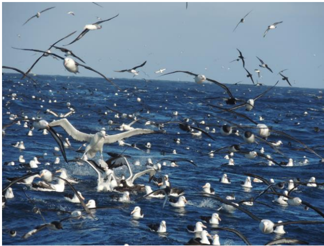
3. Albatrosses and petrels gather behind a fishing vessel in Argentine waters.