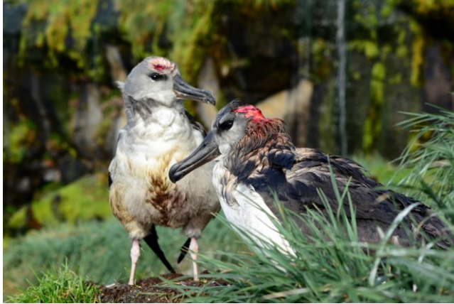
2. Endangered Grey-headed Albatross Thalassarche chrysostoma chicks 'scalped' by introduced House Mice on South Africa's Marion Island.