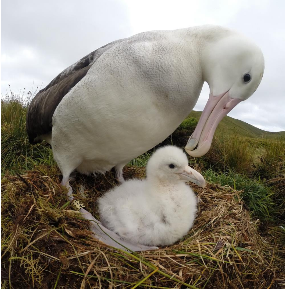
1. A Critically Endangered Tristan Albatross Diomedea dabbenena on the United Kingdom's Gough Island broods its downy chick.