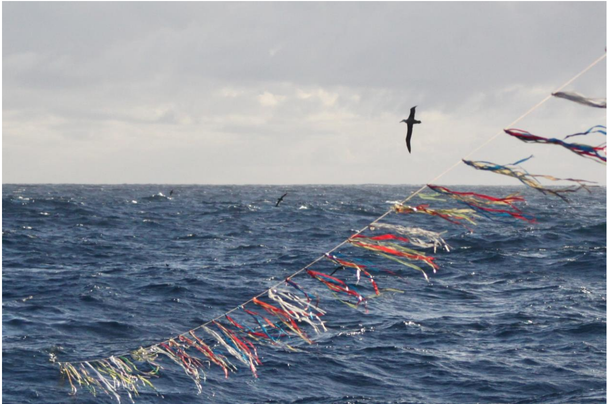
4. A bird-scaring line with its hanging streamers keep albatrosses and petrels away from the hooks on a Brazilian longliner.