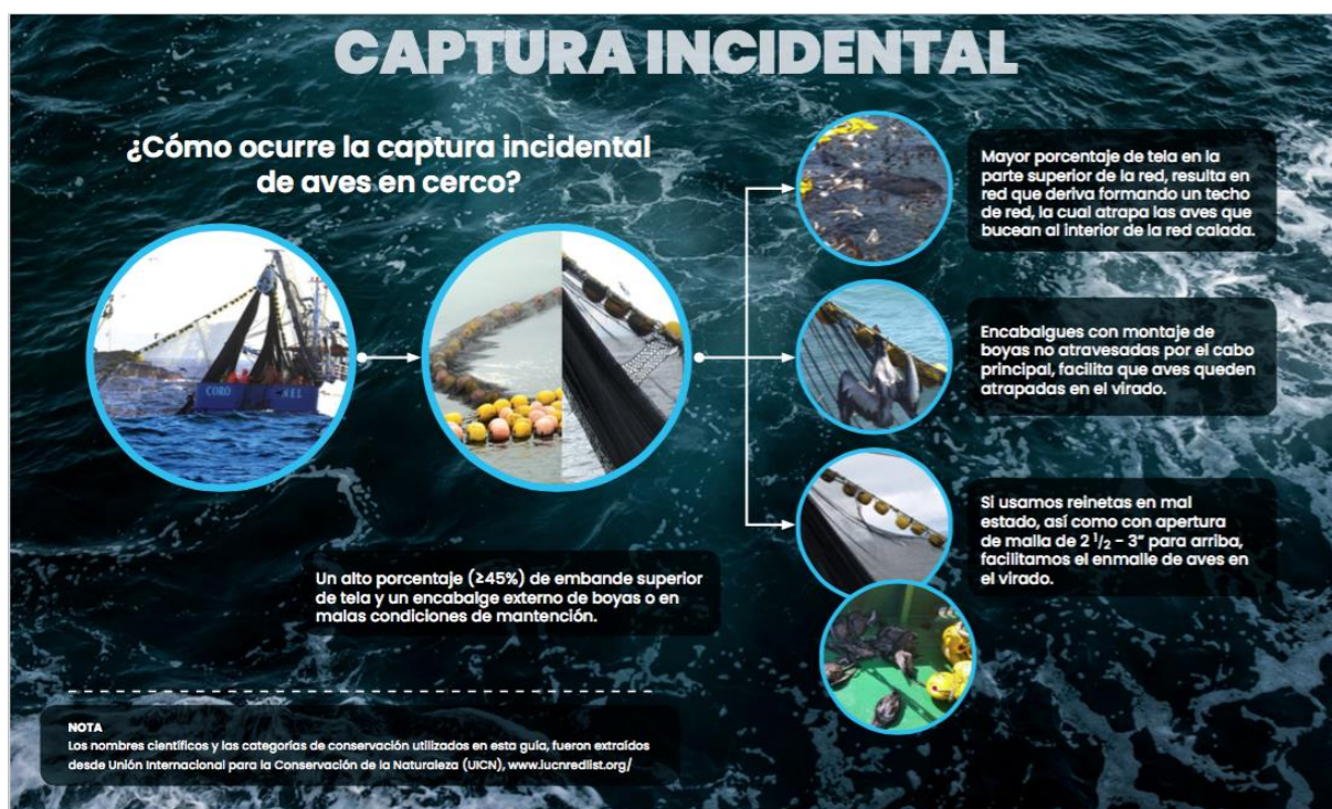
Figure 2. Infographic with sources of seabird bycatch identified for small-scale purse seine fisheries (sardine, anchovy, and jack mackerel in Chile).

Purse seine fisheries for tuna have been recognized as non-problematic for seabirds, including mitigation as change in fishing practice ( e.g. avoiding sets with non-target species) and entanglement prevention applied to cetaceans, sharks, and sea turtles (Swimmer et al. , 2020). On the contrary, in vessels for forage fish the seabird bycatch have been identified by the entanglement of seabirds in different parts (hotspots) of the purse seine gear (Suazo et al. , 2016, Fig. 2).