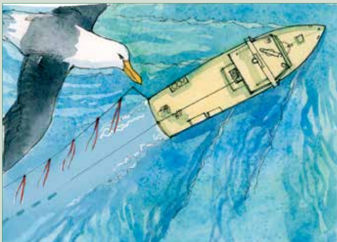
Figure 1. From the air, blue-dyed squid merge with the surrounding water.

The dyeing process requires bait to be fully thawed before they can take up sufficient dye. Food colouring, such as Virginia Dare FD C Blue No. 1 or E133, is commonly used. In Brazil, a company that specialises in food colouring, Mix Industria, has developed a dye to specifically to colour fishing bait. Depending on the concentration of the dye and the desired colour, bait is soaked from 20 minutes to four hours. Comparison with a colour card determines when the desired colour has been achieved. Bait is often refrozen after dyeing and used in a semi-frozen state to improve bait retention on hooks.