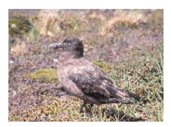
Numbers of Subantarctic skuas have decreased at Marion Island