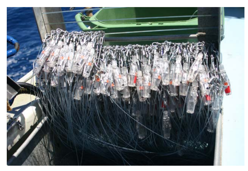
Figure 1 Hook Pods clipped onto the swive