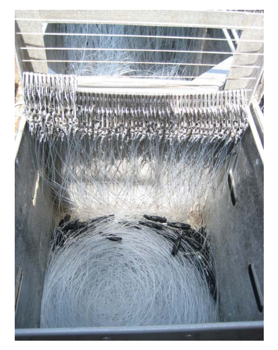
Figure 2 Hook Pods fleeted into the setting box