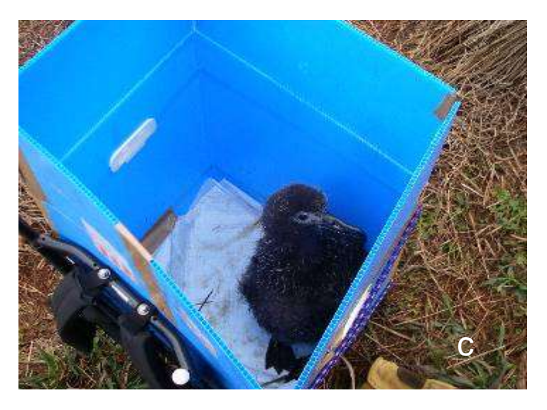
Figure 2a and b Specially designed boxes used for Short-tailed Albatross transport. 2c Simpler container used for pilot work with black-footed albatross.