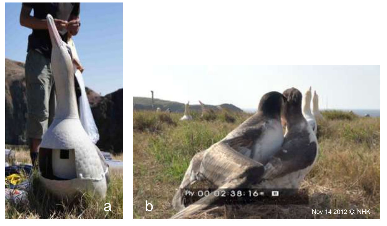
Figure 5a Satellite-linked video camera inside STAL decoy; 5b Image captured with video camera of male from 2008 translocation copulating with unmarked female 4 years later.

If the translocation site is inaccessible or cannot be manned once the operation is complete a camera system that allows remote access by satellite or collects data that can be retrieved later is extremely helpful for documenting the visits of non-SAT-tagged birds to the colony and observing their interactions with other birds. The Short-tailed Albatross project benefitted greatly from the interest of NHK TV Japan. This TV station ingeniously installed satellite-linked video cameras in the decoy area (Figure 5a) These devices have provided a wealth of information about behavior of the birds and identification of non-translocated visitors. We recommend installing some sort of camera system to capture events that may only occur when humans are not present (Figure 5b).