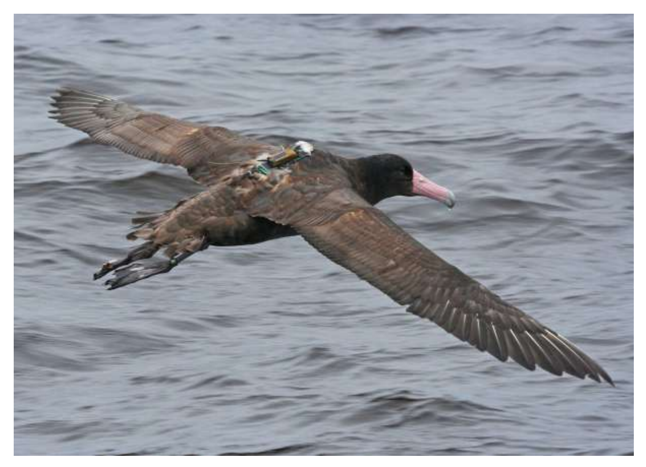
Figure 4 . Short-tailed Albatross fledged in 2009 with satellite transmitter observed at sea, October 2009.

One important finding that has recently emerged from Short-tailed Albatross fledgling telemetry work is that all post-fledging mortalities from both Torishima and Mukojima have been females (R. Suryan pers. comm. Table 2).