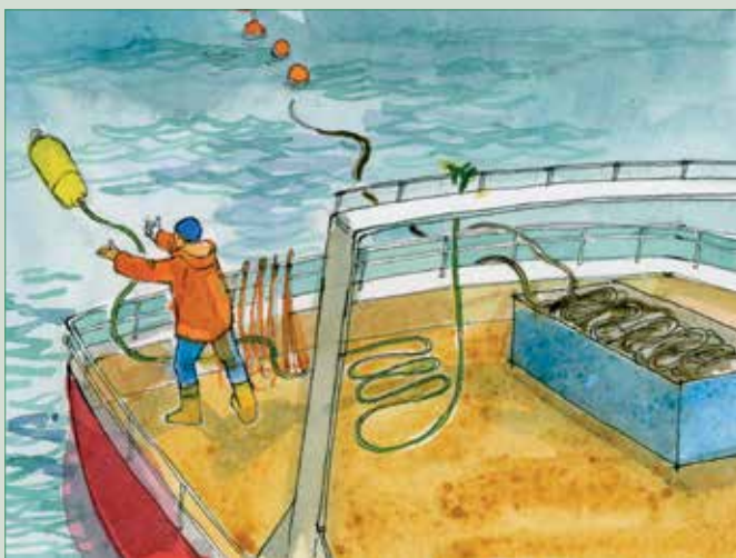
Figure 2. Streamer lines should be deployed before the first hook leaves the vessel.