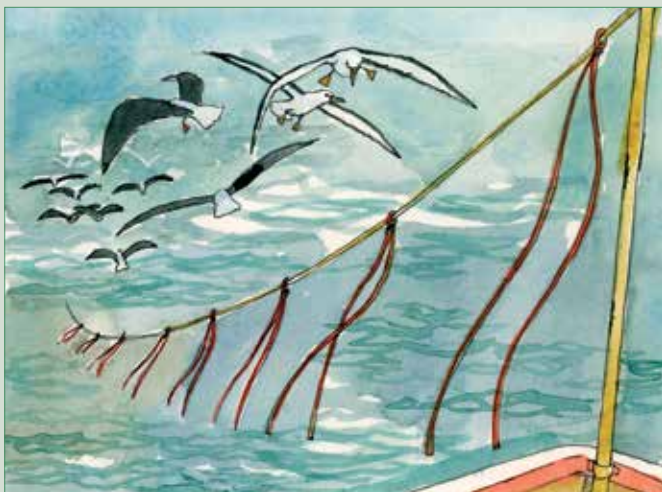
Figure 1. Streamer lines deter seabirds from feeding on baited hooks.

When deployed properly under suitable conditions, streamer lines can be very effective at reducing seabird mortality. For example, in the North Atlantic, experimental trials showed a 98% reduction in seabird bycatch (Løkkeborg, 2003) when a streamer line was used. In Alaska, paired streamer lines have the potential to reduce seabird bycatch of surface feeding species, primarily northern fulmars and Laysan albatrosses, by 88–100% (Melvin et al. , 2001). However, in this fishery, shearwater bycatch rates remained unchanged, as their superior diving abilities allow them to target baits beyond the effective protection of the streamer lines.