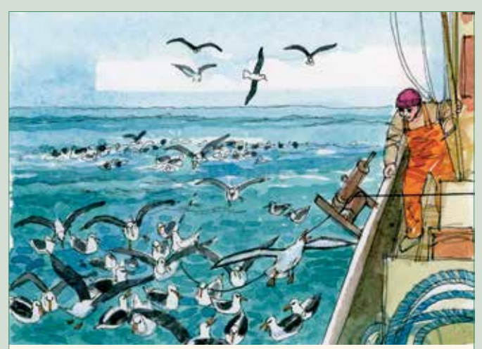
Figure 1. Birds can become hooked during hauling, often sustaining non-lethal, but detrimental injuries.

Some vessels have experimented with water cannons or fire hoses to deter birds from approaching the hauling station. Using a 30 kw electric centrifugal pump, Kiyota et al. (2001) experimented with various nozzle tips, flow stabilisers and angles of attack to determine the maximum range of the water jet. Under ideal