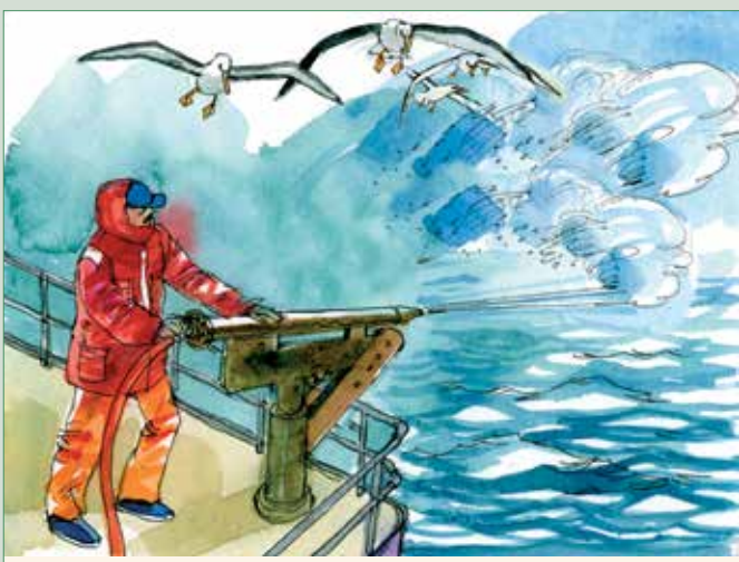
Figure 3. Water cannons lack the range to effectively deter seabirds from feeding on baited hooks.

In heavy weather the vertically hanging streamers, often weighted at the bottom, can flick up and interfere with fishermen working at the hauling hatch.