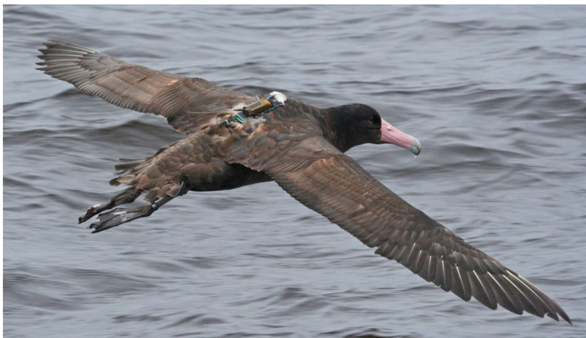
Figure 5. Short-tailed Albatross fledged in 2009 with satellite transmitter observed at sea, October 2009.

One important finding that has recently emerged from Short-tailed Albatross fledgling telemetry work is that all post-fledging mortalities from both Torishima and Mukojima have been females (R. Suryan pers. comm. Table 2).