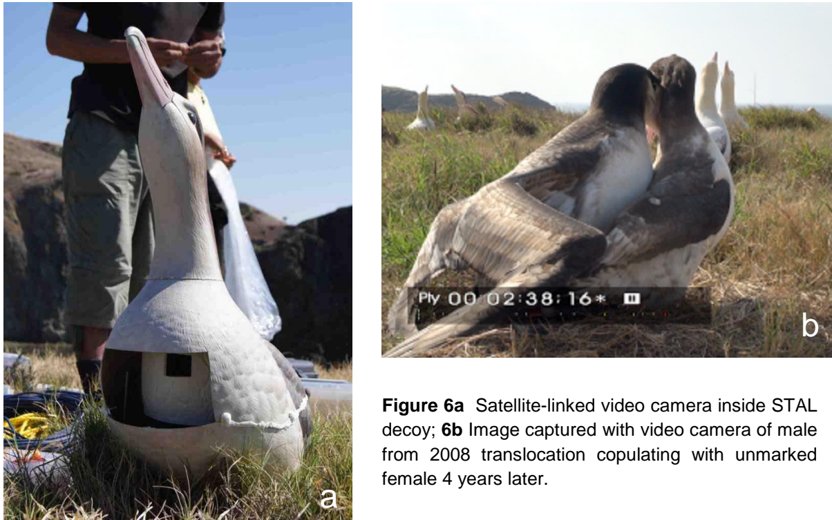
Figure 6a Satellite-linked video camera inside STAL decoy; 6b Image captured with video camera of male from 2008 translocation copulating with unmarked female 4 years later.