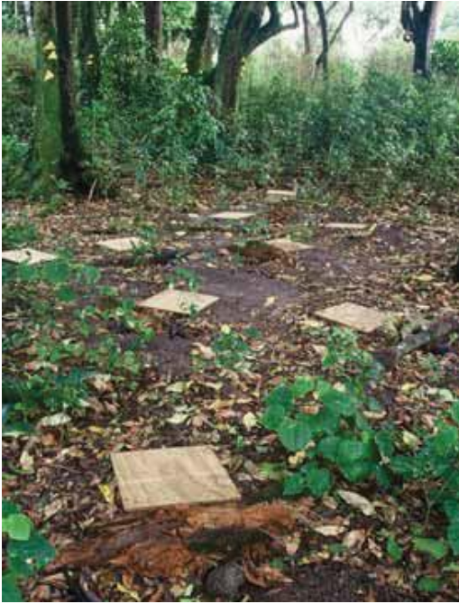
Figure 3. Flat-ground burrows (double lid type) at the Chatham petrel artificial colony site, Pitt Island (Rangiauria).