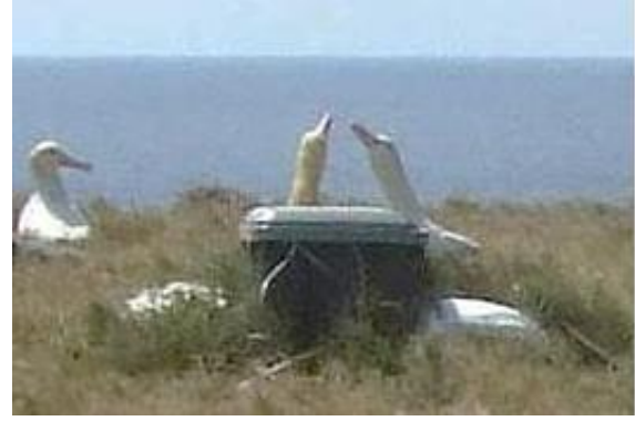
Figure 1b. Example of part of the sound system deployed at Mukojima Island to attract Short-tailed Albatross.