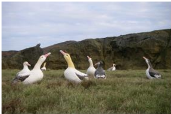
Figure 1c. Short-tailed Albatross decoys. Note different decoy poses and plumages.