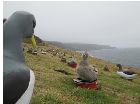
Figure 1d. Chatham Albatross chicks on artificial nests with adjacent decoys (Chatham Taiko Trust).

The decoys and sound system serve two purposes: (1) they provide visual and auditory stimuli to the developing chicks, which may allow them to re-locate the site when they attain breeding age; and (2) the calls and visual cues may attract others of the species to the site from a distance, and at closer range, the visual cues may encourage the birds to land. Juveniles that were not reared at the site but have not yet bred, have the potential to increase the population at the new site. A number of Short-tailed Albatross sub-adults that were not reared at the Mukojima translocation site have visited there, including one female that paired with a translocated male and laid an egg there in 2013 and 2014.