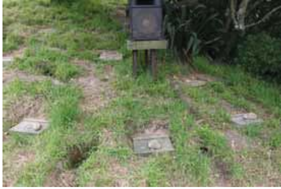
Figure 1a. Sound system speaker on Matiu/Somes Island, New Zealand. The burrows with rocks on have been visited by prospecting adult Fluttering Shearwaters.