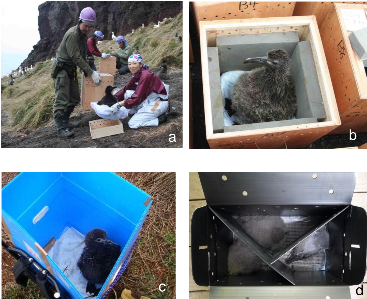
Figure 2. a and b Specially designed boxes used for Short-tailed Albatross transport. c Simpler container used for pilot work with Black-footed Albatross. d. Animal carry box with three compartments used to transfer Pycroft's petrels in New Zealand. Exterior walls are white to reflect heat. Note: use less tape than seen here to fix matting to floor so as to optimise drainage of excrement.

The transfer box design used for most burrow-nesting petrel transfers in New Zealand is based on a standard pet (cat) box (Gummer 2013). There must be enough space and ventilation to avoid overheating issues, and to minimize wing and tail feather damage of the more advanced chicks. Boxes can hold one large chick, two chicks of a small-medium species with a single diagonal divider, three chicks with custom-made interlocking dividers (Fig 2d), or four chicks of a very small species with double diagonal dividers. Boxes also need to be heat-reflective, dark inside to reduce chick stress levels, and have flooring that provides grip and absorption of waste or regurgitant.