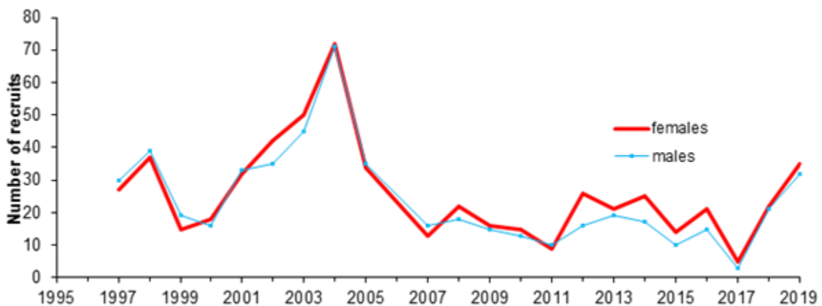
Figure 2. Annual number of birds breeding for the first time in the study area.

Recruitment. The number of birds breeding for the first time in the Study Area in 2019 was higher than in any year since the population crash in 2004 (Figure 2). Around a third of all birds nesting this year were new recruits to the breeding population, and probably because there were so many inexperienced breeders, there was a relatively high (10%) rate of nest failure by the end of the laying period.