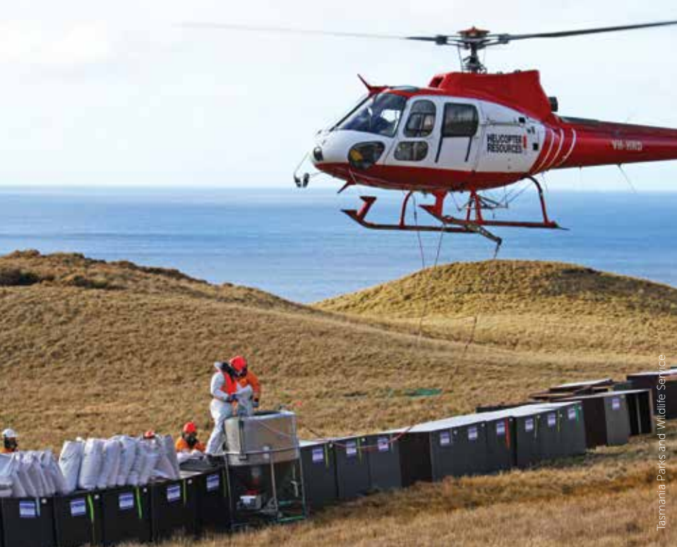
Tasmania Parks and Wildlife Service