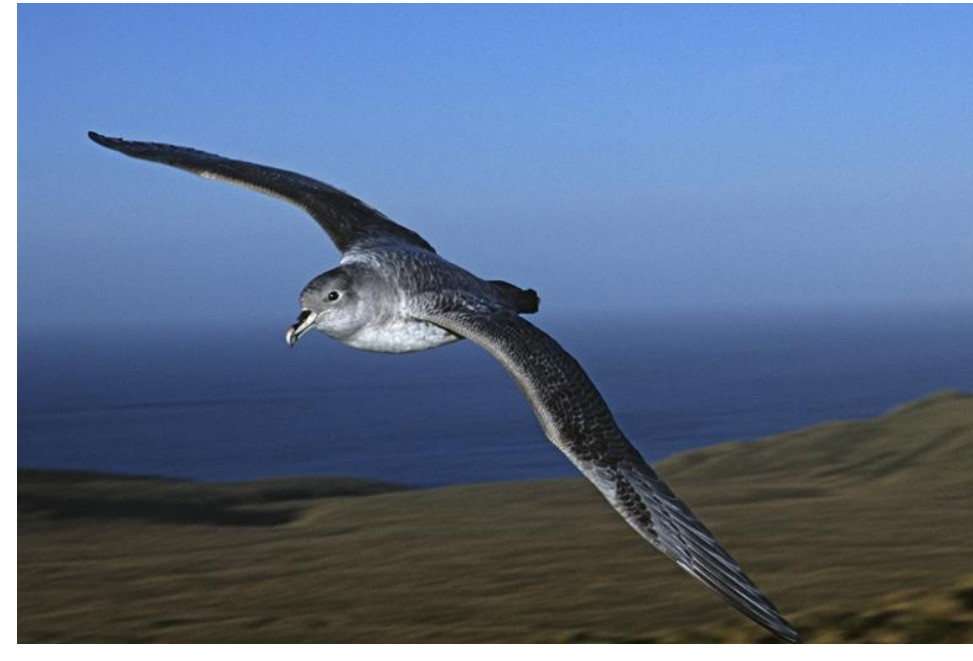
Photo © Tui De Roy, image not to be used without photographer's permission

Brown Petrel Black-tailed Shearwater Black-tailed Petrel Cape Dove Pediunker